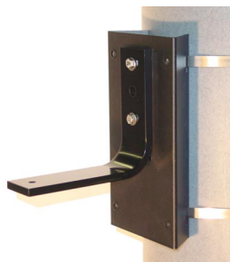
EXMB.015 + EXMB.020