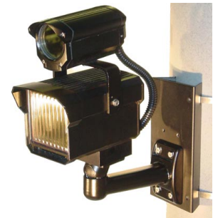
EXMB.015 + EXMB.051 + REG