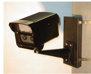
EXMB.015 + EXMB.025 + EX82