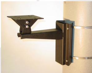
EXMB.015 + EXMB.003

Below: Application examples of the EXMB.015 Pole Mount Adapter Bracket in use with other equipment.